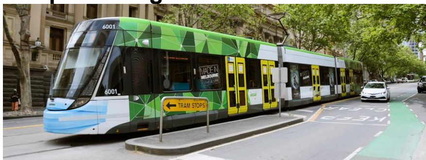
Even Melbourne's newest trams are affected by COVID-19 !