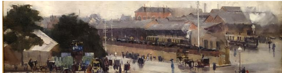
Part of an Arthur Sreeton painting - with trams - collection of Art Gallery of NSW